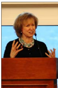
The Right Honourable Kim Campbell , 19th and first female Prime Minister of Canada