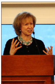
The Right Honourable Kim Campbell , 19th and first female Prime Minister of Canada