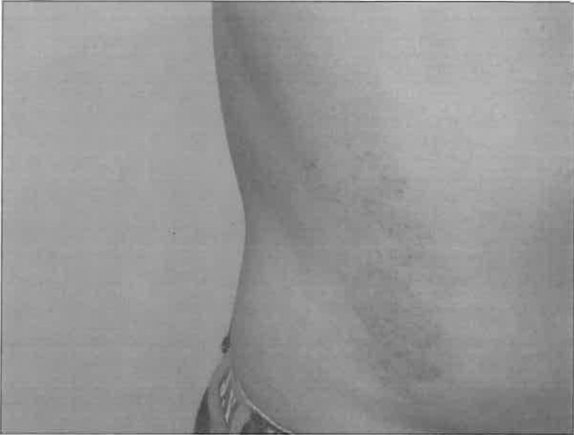
Taken 2010-01-22