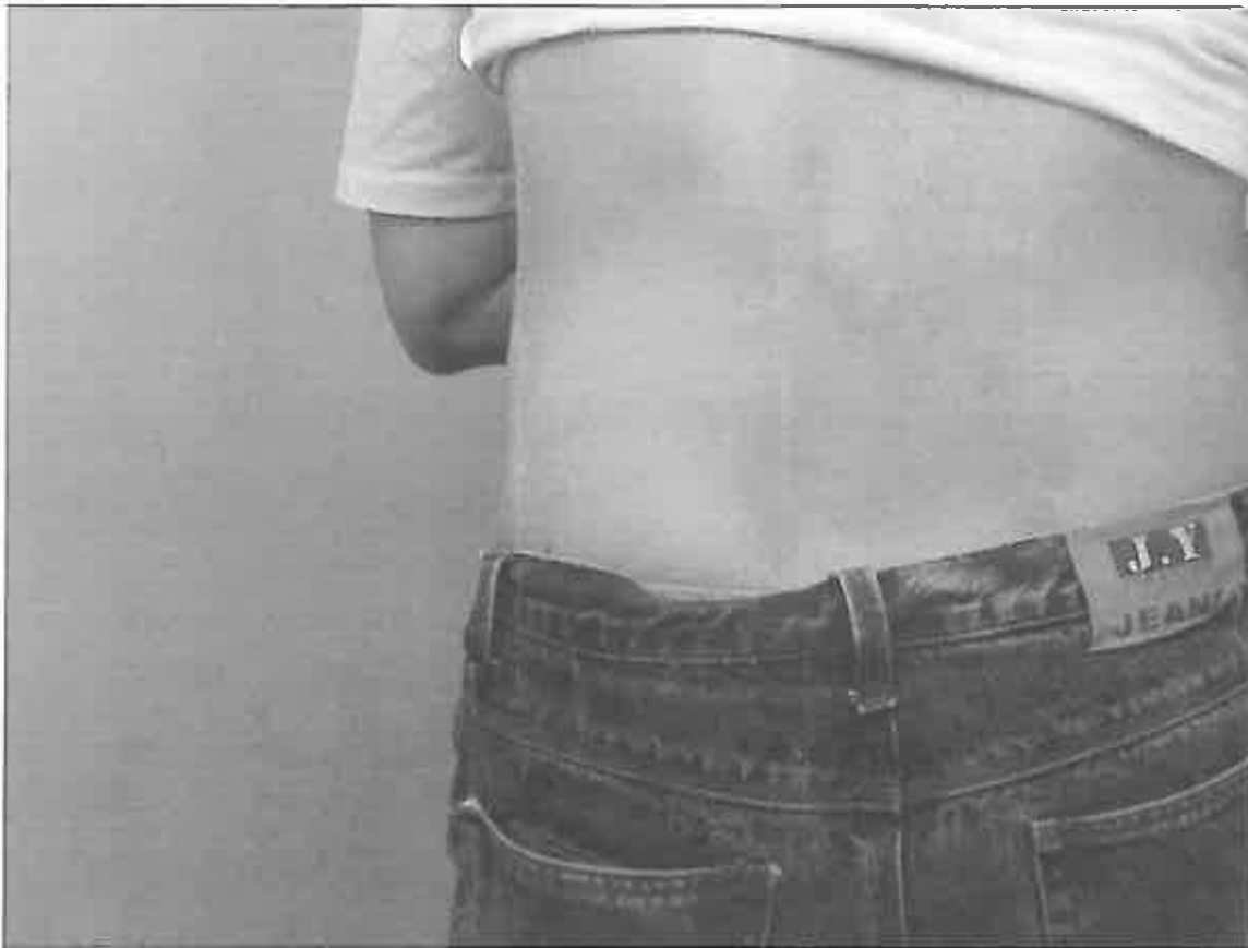
Taken January 22 nd , 2010 by Sgt. BIEG