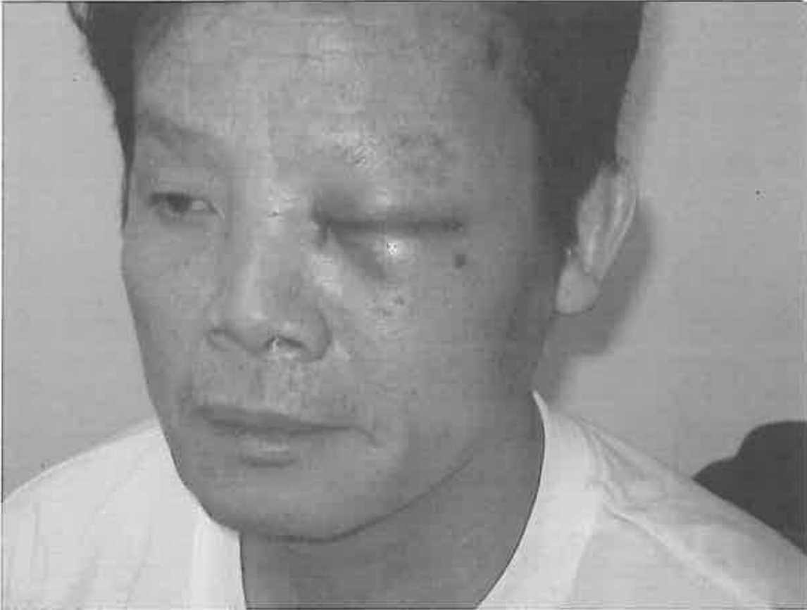
Taken 2010-01-22