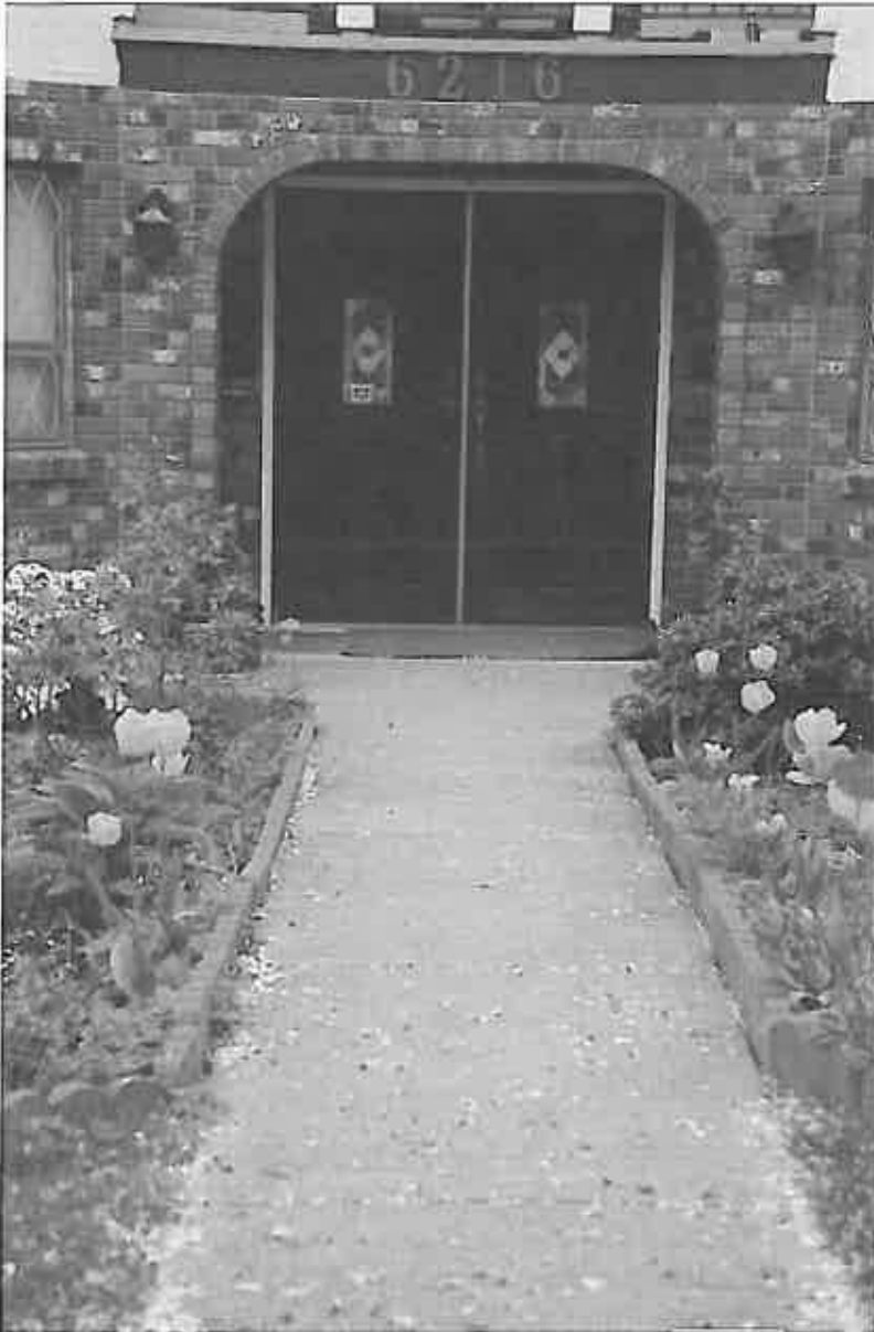
Close-up of Pathway to Front door of 6216 [REDACTED] St.