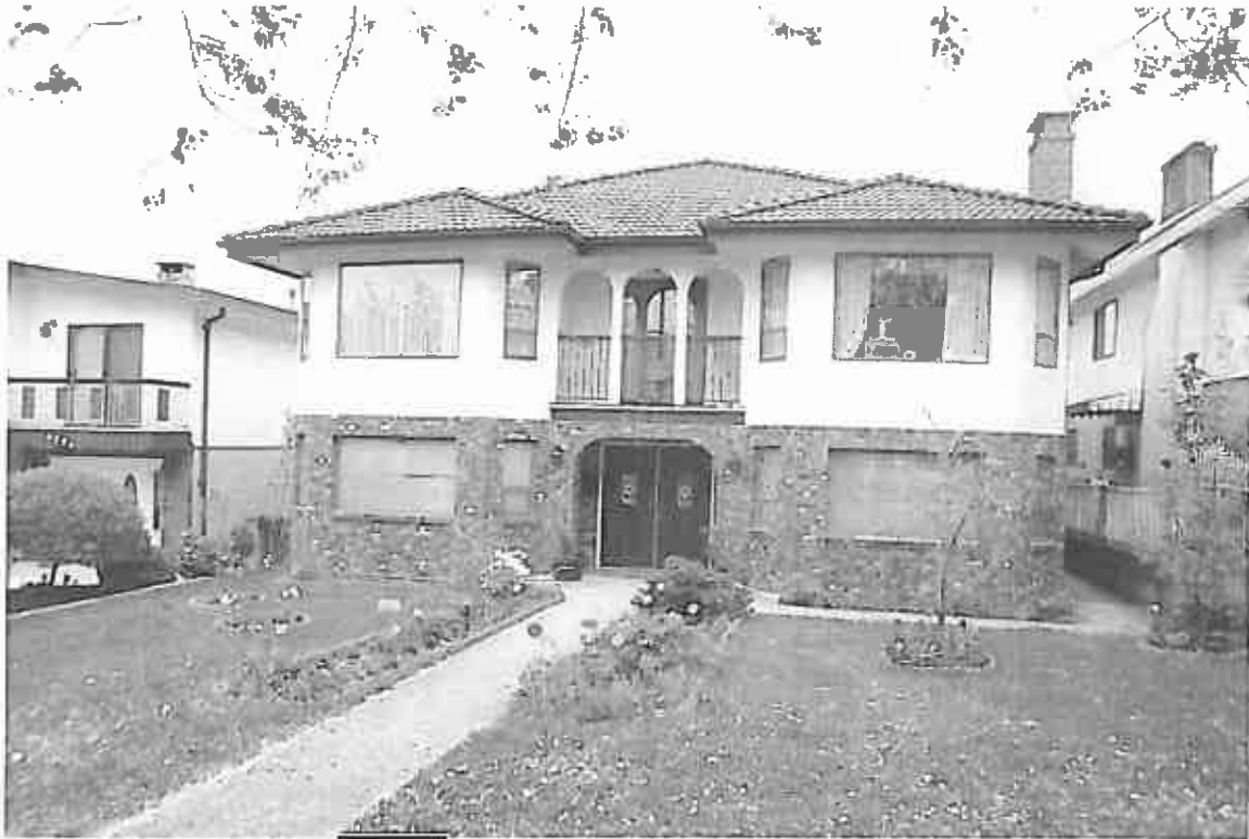
View of Front of 6216 [REDACTED] St.

Cst. WARREN also obtained photographs of the street including the location of street lights located on [REDACTED] St.