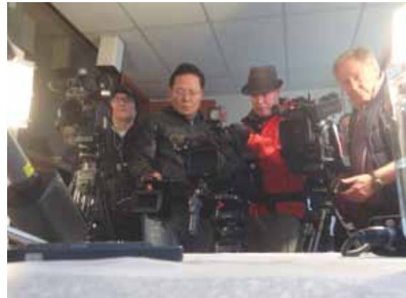
MEDIA AT BCCLA PRESS CONFERENCE

When a complaint was filed under Alberta’s privacy legislation against a union for video-taping at a picket line and posting those images online, the BCCLA intervened in the resulting